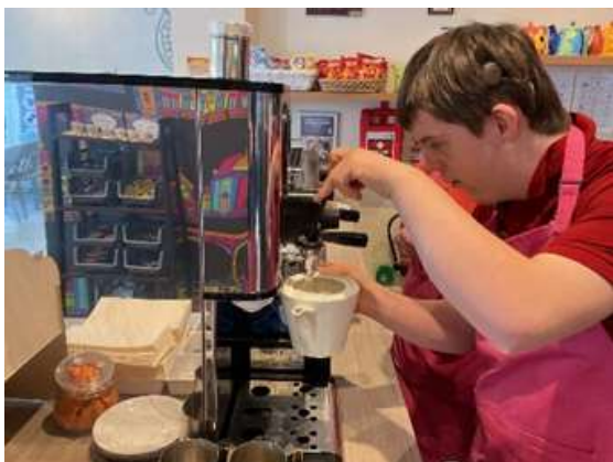
St John's students undertaking work experience at the Chocolate Factory and Café in Harrogate.