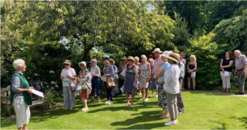
Visit to Stillingfleet Nurseries – a hot day in July.

And finally – when a plant is feeling sad do the others photo-sympathise?