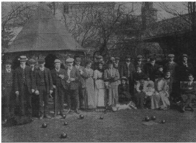
Boston Spa Bowling Club in 1900

Address - Stables Lane, Boston Spa LS23 6BX