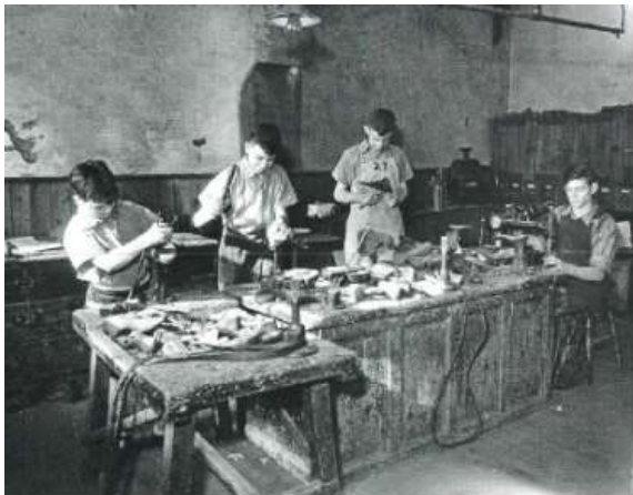
Vocation training classes at St John's in the 1940's.

We warmly invite community groups to connect with us. Embracing change, we are always eager to explore new ideas and collaborations that will shape our future together.